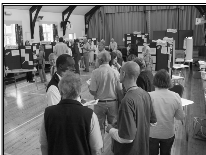
'Have Your Say' Day July 4 th 2008 Porlock Village Hall

The action plan will take a number of years to complete – some issues require short term actions, which are in hand. Others are more complex and highly dependent on support from outside organisations.